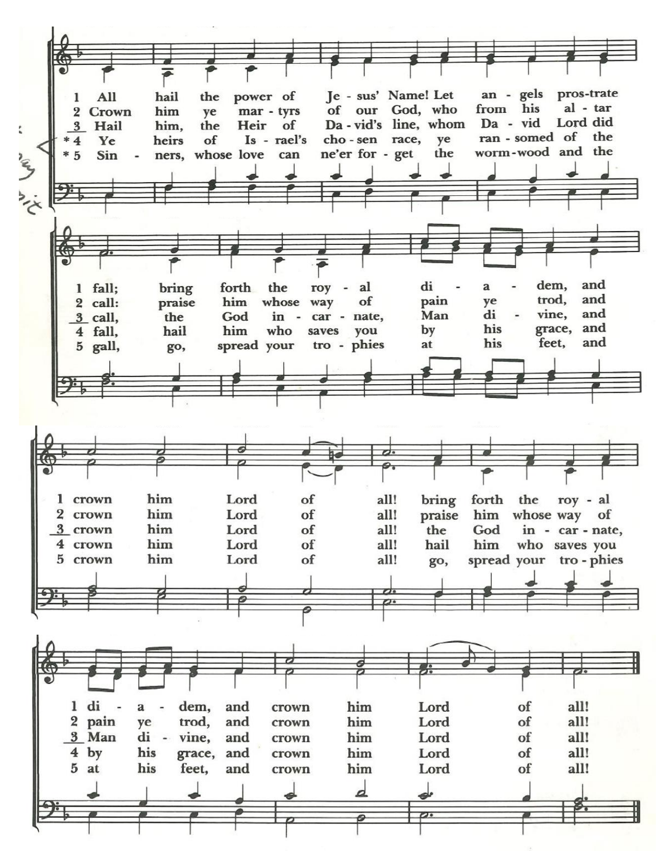
6 Let every kindred, every tribe, on this terrestrial ball, to him all majesty ascribe, and crown him Lord of all!